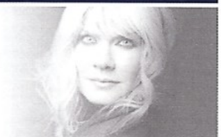
NATALIE GRANT Worship Music

We will gather in the Fellowship Hall at 6:30 PM to share heavy hors d'oeuvres. The virtual event will conclude at 11 PM, but you are welcome to stay as long as you're able.