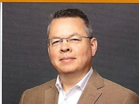
ANDREW BRUNSON Imprisoned in Turkey