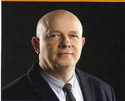
PETR JASEK Imprisoned in Sudan